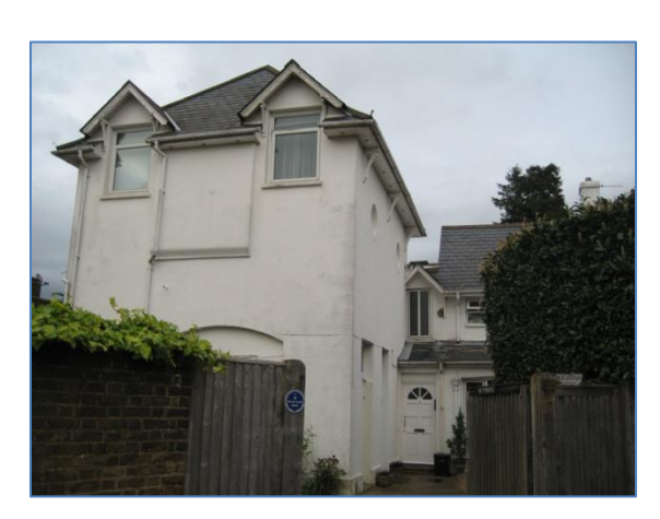
17 Games Road, before it was demolished.