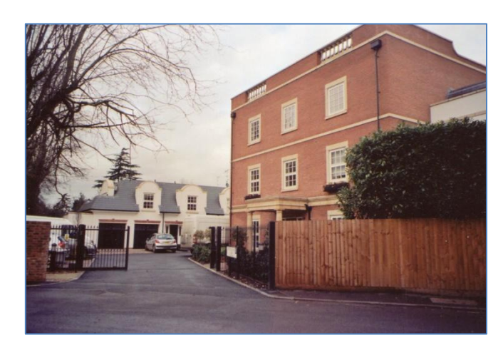
Games Road 18 December 2013 (now Bolingbroke Close)