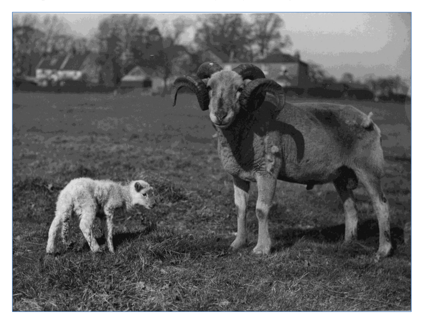
'Before you ask. Yes! She is mine, and just you try to put your modern identification tag in our ears.' The ram and lamb at Bentley Heath Farm in springtime in c.1937.